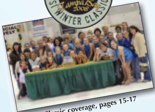
Winter Classic coverage, pages 15-17